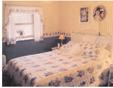
THE Mrs. Schoonover CLASSROOM

The white wicker accessories in this room give you the bright, cheery feel of strolling through a flower garden. The window overlooks our spacious lawn beyond the front deck below. This room is on the upper floor and has a queen-size bed. Your unattached bath, just five steps across the hall, is shared with the adjacent, Mrs. Wolfe's classroom.