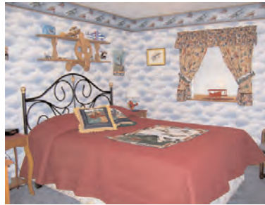
THE Mrs. Wolfe CLASSROOM

The airplane décor of this upper floor room gives you the feel of sleeping in the clouds. This room pays tribute to the EAA Convention held annually in neighboring Oshkosh. Through the window, you will enjoy a view of our tree-filled front yard. Your un-attached bath, just three steps across the hall, is shared with Mrs. Schoonover's classroom next door. "Take off" on your dream flight in the queen-size bed. You will just "plane" love it!