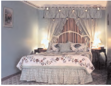
THE Mrs. Hemp CLASSROOM

Stretch out and relax in the romantic atmosphere of our "suite" room. It features a lightly flowered décor with a loveseat and bistro set in a very ample room. Patio doors lead you to your balcony with a view of our back yard and some of our more majestic maple trees. This upper floor classroom has a queen-size bed and a private, attached bath.